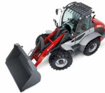
Front wheel steering